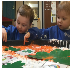
St Patricks Day