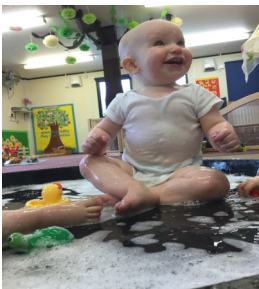
World frog day

We love a good reason to dress up here at the Princess of Wales Day nursery. For world book day we dressed up as our favourite characters and had lots of stories and discussions about our favourite books. The staff dressed up as the dogs from 100 and 1 Dalmatians!